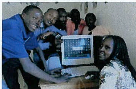
Build Skills with "lost" Youth in Kenya

'To provide professional training to Kenya's high school dropouts who lack useful academic or technical skills'