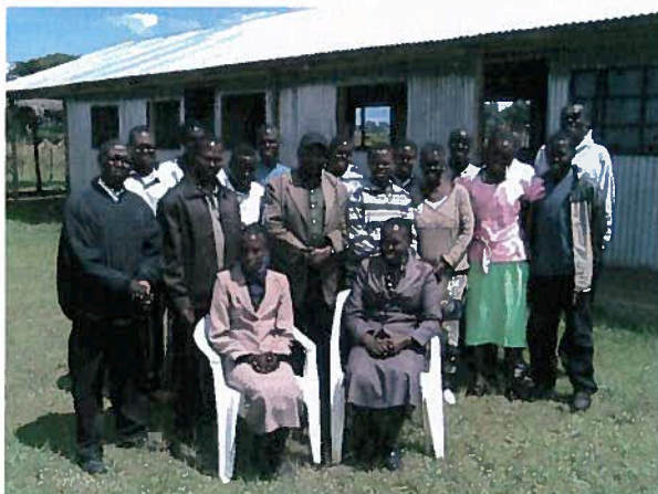
New students and the temporary facilities